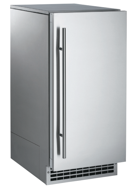
model shown is SCN60PA-1SS