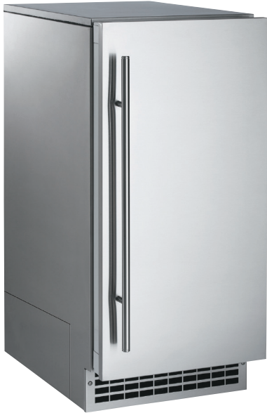
model shown is SCN60PA-1SS