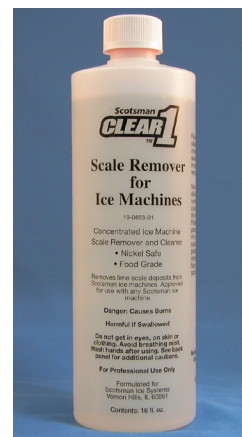
Part #19-0653 Clear One Concentrated Scale Remover