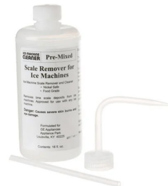
Part#19-0664 Clear One Pre-Mixed Scale Remover with Special Bottle